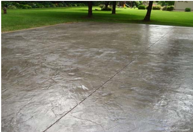
Cem Floor Color-Seamless Flat Texture Color

Heavy Duty Floor Approximately 6.00 kg/m 2