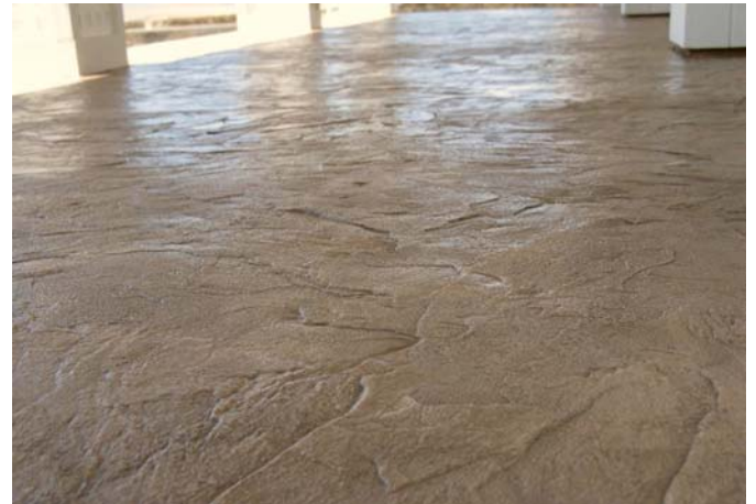
Cem Floor Color-Seamless Flat Texture Color