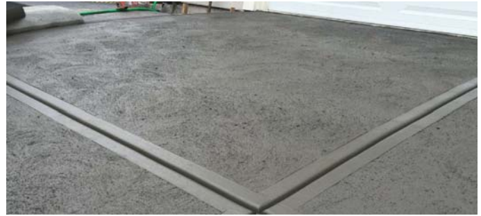
Wet Applied Method, Expansion Joint