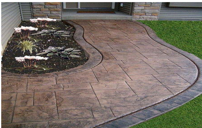
Cem Floor Color- Jointing Flat Texture Color