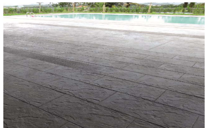
Cem Floor Color-Jointing Flat Texture Color