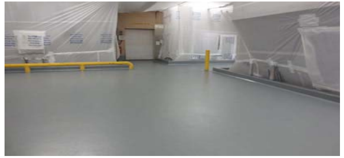
Cem Floor Color-Flat Smooth Texture Color