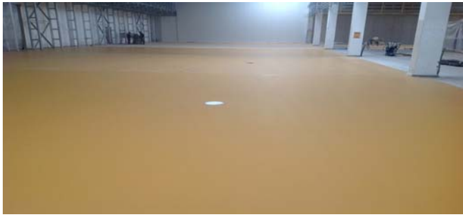
Cem Floor Color-Flat Smooth Texture Color