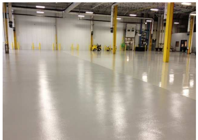
Factory Industrial Floor Matt Orange Peel & Glossy