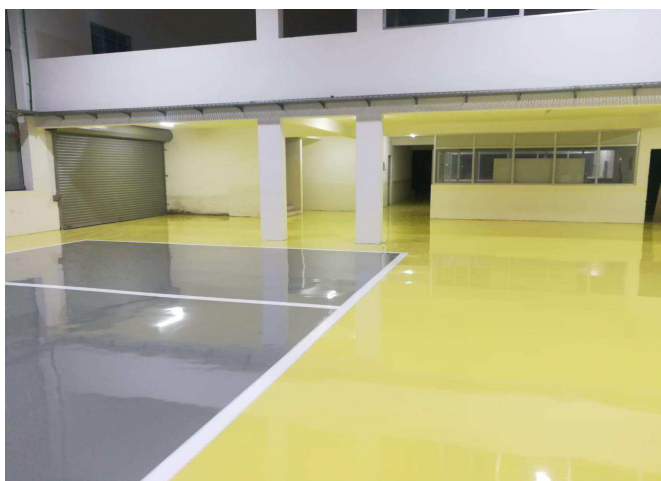
School Multi Purpose Hall [Glossy Finish]

Mix materials with low speed drill and paddle for approximately 2-5 minutes. Insure a thorough mix. Never mix more material than can be used in thirty (30) minutes. Do not apply Epoxy when ambient or temperatures are below 50 °F