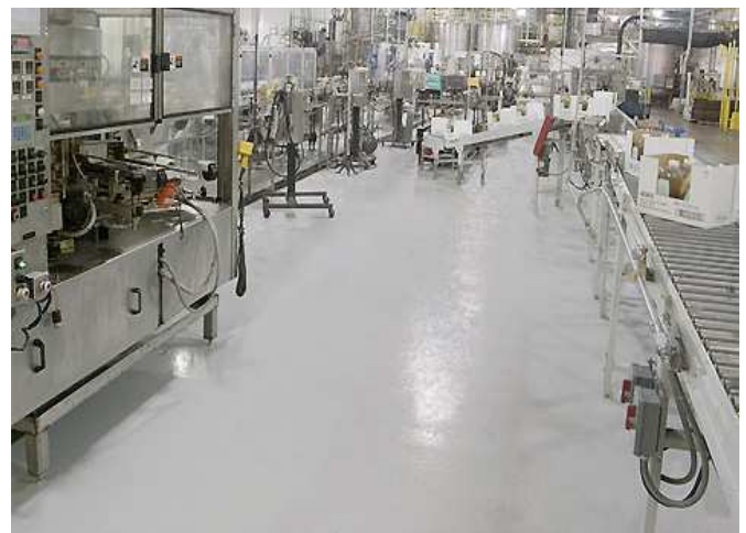
Food Drinking Flooring [Hot Cook Water Area]