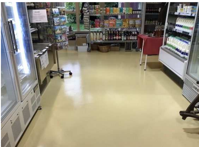
Food Drinking Flooring