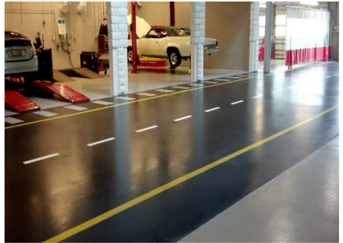
Vehicle Car Service Centre Matt with Orange Peel Finish