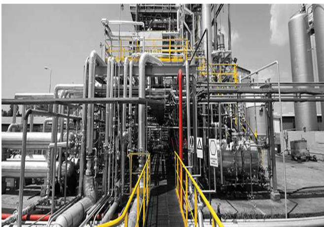
Gas & Oil Factories, Hot Pipe & Floor Area