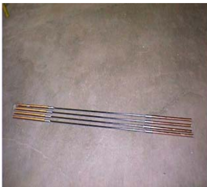
Build Strength GFRP Rod Rebar & Diameter Size