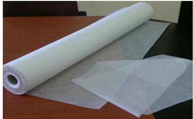
Waterproof Mat Fabric (Non Woven)