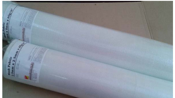
Waterproof Mat Model